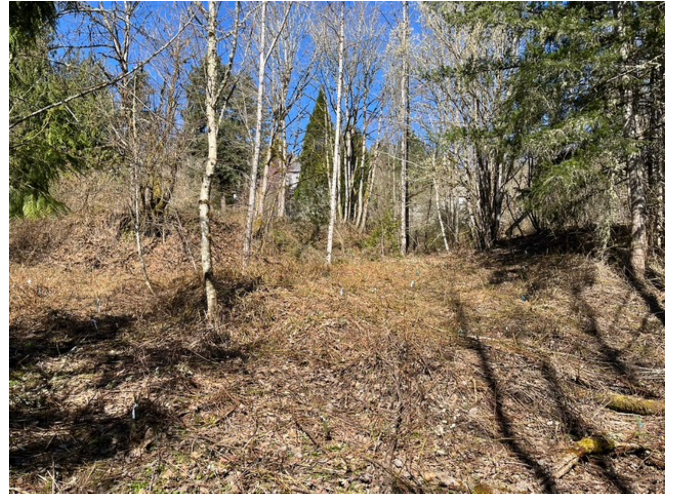
Here it is after planting in the same area.