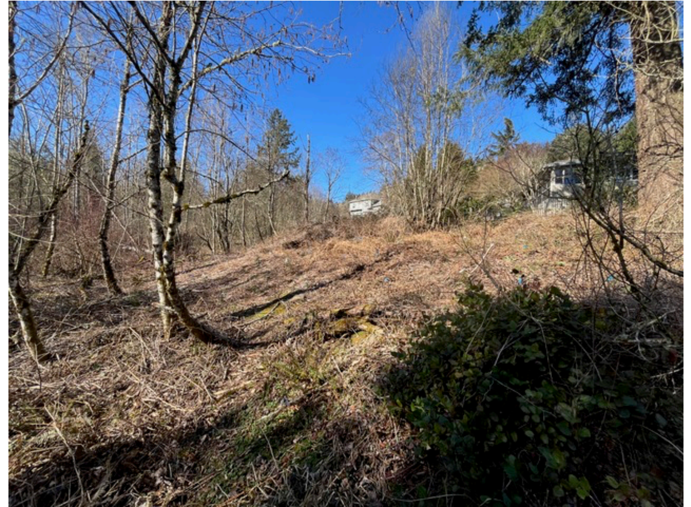
After , with planting, although trees won't show for another year or two, but the clearing is still impressive.