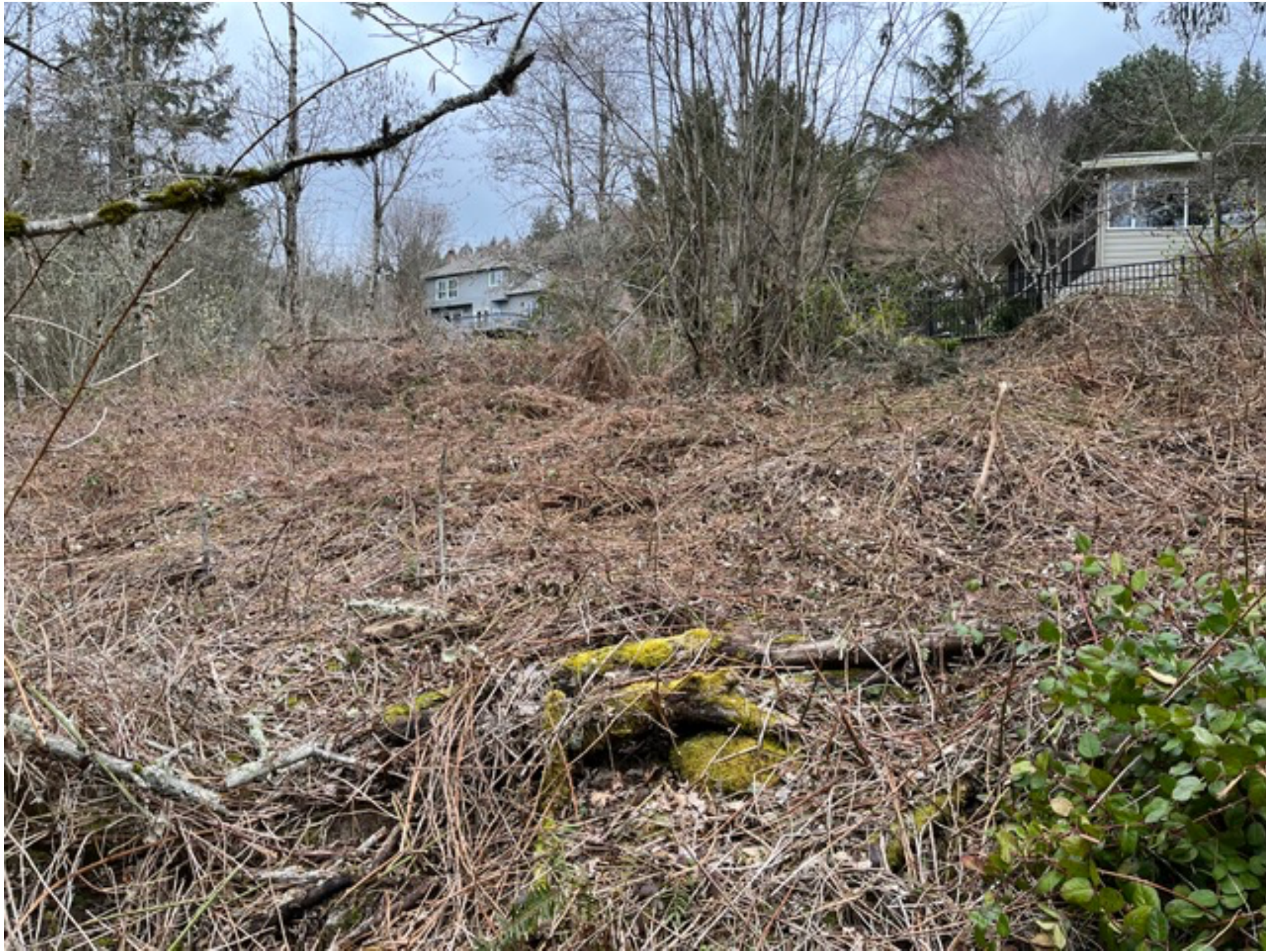
Before , with partial cutting.