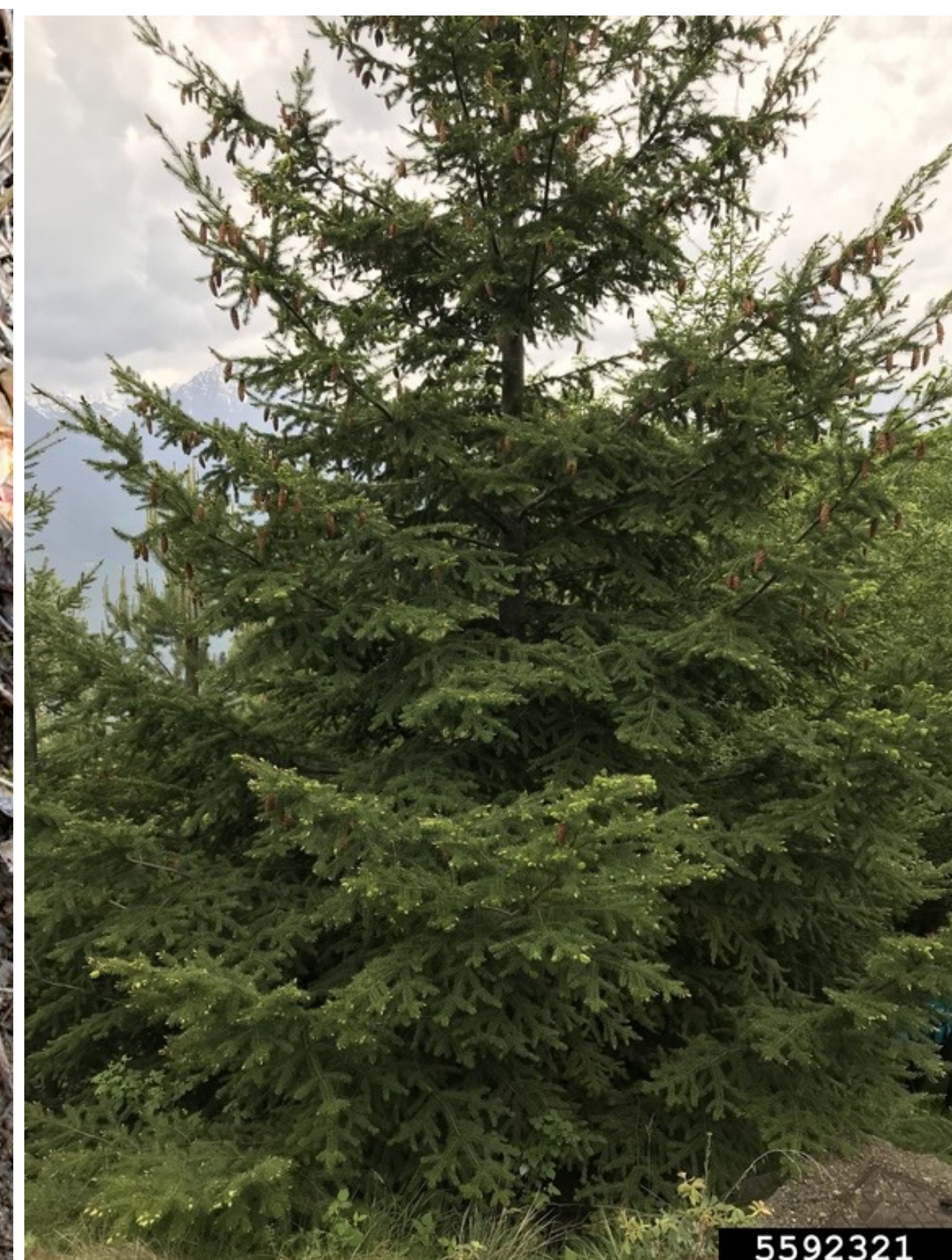
Jona Villa, Bugwood.org