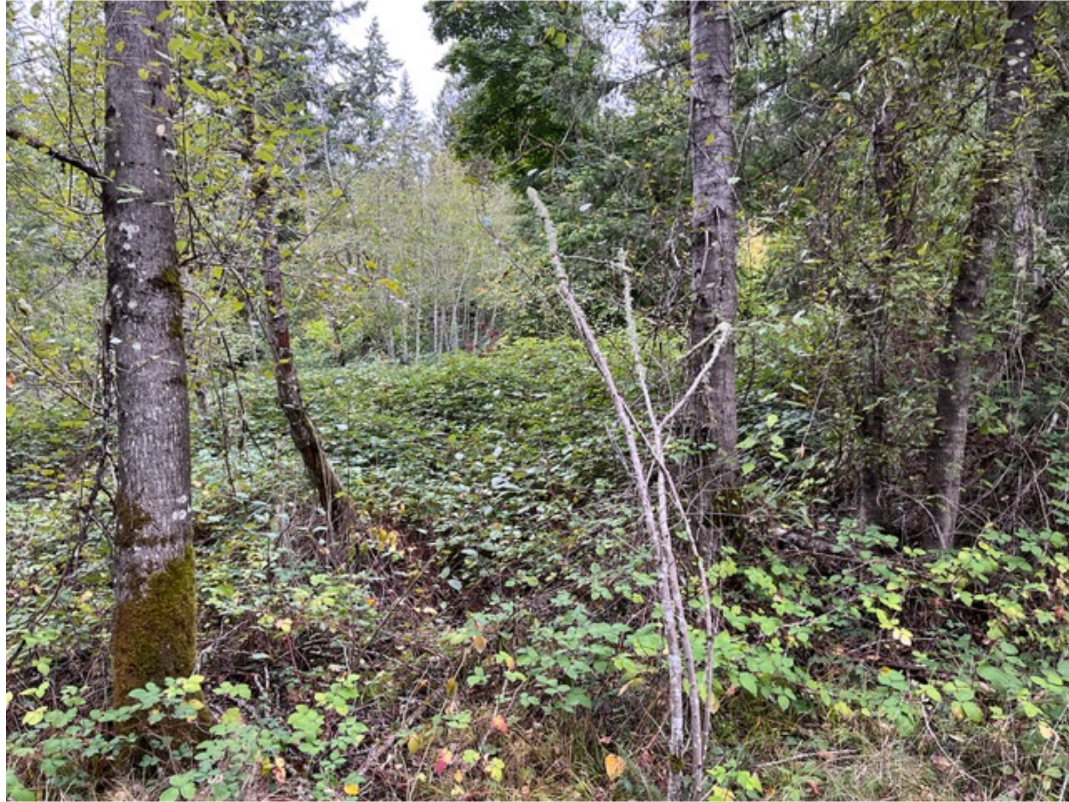
Here is a photo of an area before cutting blackberry canes.